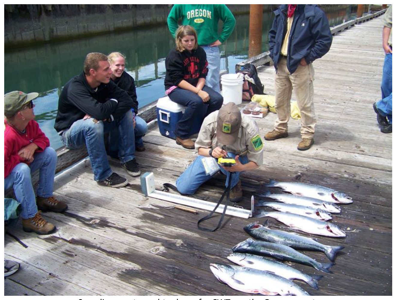
Sampling sport-caught salmon for CWTs on the Oregon coast.